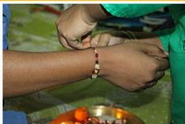
A rakhi being tied during Raksha Bandhan